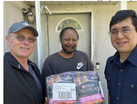
Rotary on the Road